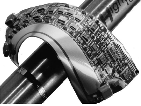
Highly flexible Multilayer assembled with SMD

The HiCoFlex technology [1] starts with rigid substrates, alumina or glass plates, which are used as a carrier during the multilayer build-up process and the assembly of components. First a thin 'release layer' is applied on these substrates. The multilayer is built-up by repetitive application of polyimide layers using a spin-on process from the liquid solution and curing and metal layers by a sputtering and if needed enforced by electroplating. Vias between conductor levels are opened by laser or plasma processing. Assembling and bonding of the components and tests of the circuits are possible while the film is still sticking